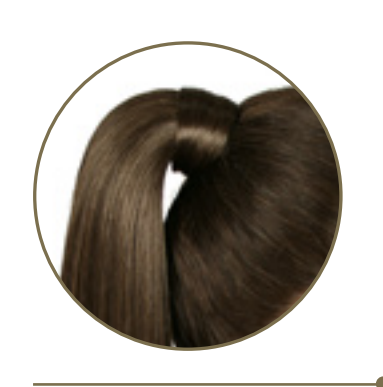
PONY TAIL - info